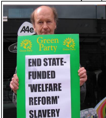
Alan campaigning against the ConDem cuts.

Now that Labour is out of office and keen to side with the poor, it's important to recognise that the ConDem cuts are based upon Labour's dirty work, much of it unreported in the press and broadcast media.